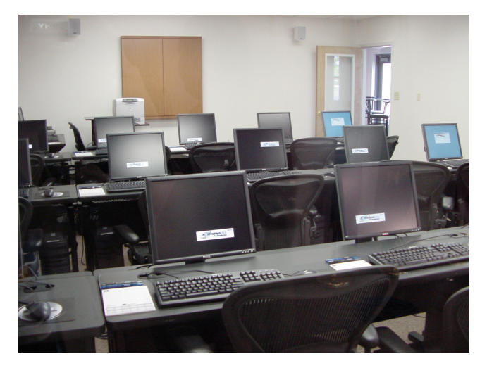
The NCA will provide professional education and technical training to cemetery employees.