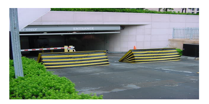
Thomas F. Eagleton Courthouse exit barriers

New procedures for entering and exiting the garage are currently being implemented. Court Security Officers or Rees guards will verify I.D. badges for all personnel prior to entering the garage. Please inform visitors and employees to use a card key for access into the garage. Since the barriers can cause serious damage to a vehicle, please notify your staff that the use of a card key is required at all times when the barriers are in operation. Be prepared to use your card key while entering and exiting the garage. A "Card Key Not Required" sign is posted over the card key readers when the barriers are locked in the down position. Please be cautious and proceed slowly while entering and exiting the garage.