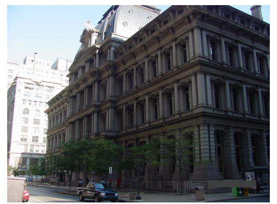
View of Old Post Office